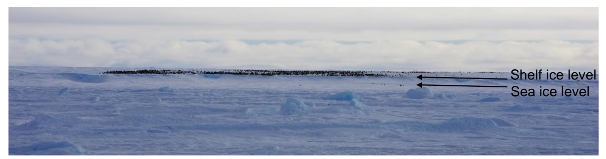
Fig S1: Emperor penguins on shelf ice on 16. November 2013. Due to large snow accumulation, multiple gradual snow ramps emerged and abolished the drop-off from the shelf ice to the sea ice.