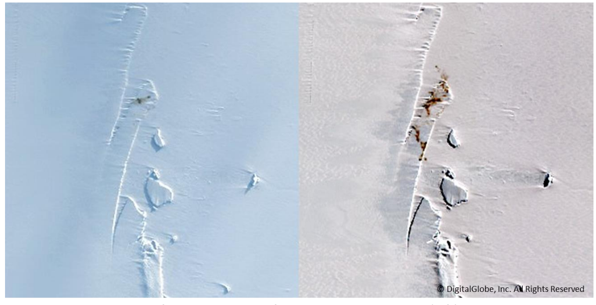
Fig S2: Satellite images of the Atka colony from 7. September 2013 (left) and 14. October 2013 (right). Faecal stains can be clearly identified on the ice shelf. After transitioning onto the shelf ice on 12. August 2013, the colony remained there in various locations until November.